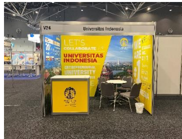
Inline stand – Fabric banner