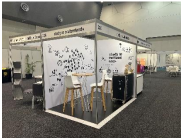
Corner stand – Fabric banner