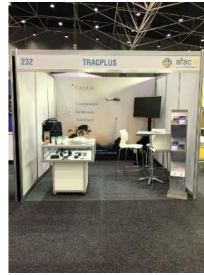
Backwall – fabric banner