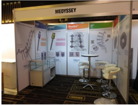
Inline stand – graphics