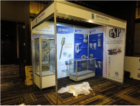
Corner stand – graphics